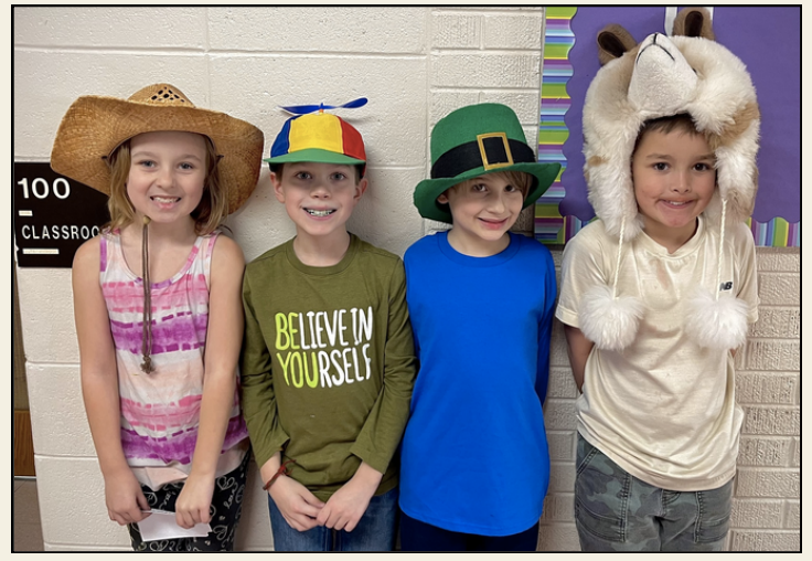
Lincoln Elementary School celebrated Dr. Seuss by having a Cat in the Hat Day.

Monthly Board Business Meetings can be viewed LIVE on the district <u>YouTube channel</u> (Beaver Dam Unified School District). In addition to LIVE access, you may also view previously recorded meetings and other district events on our YouTube channel.