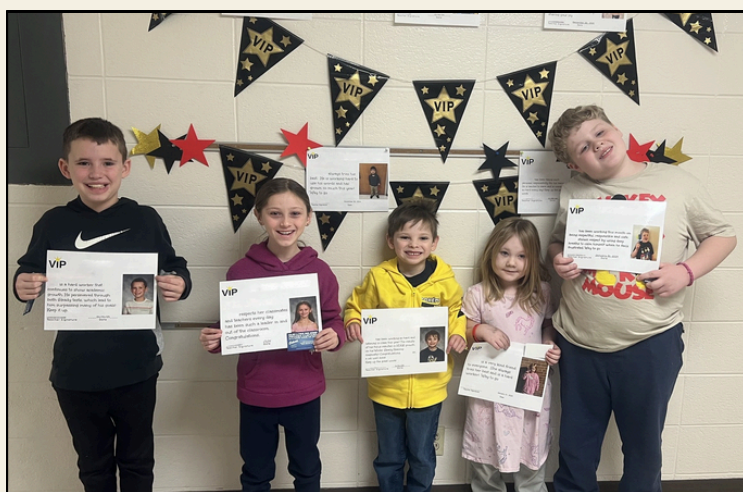
These Wilson Wildcat VIPs were recognized for their strong dedication and effort on their I-Ready diagnostic.

We are grateful for these and many other partnerships that positively impact our students and community!