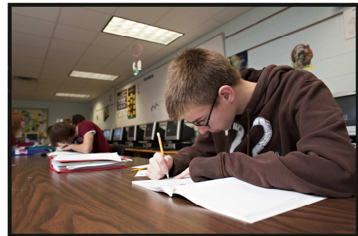
Percent of Students at an Advanced or Proficient Level

The charts below compare the percentage of students in the surrounding school districts who achieved an advanced or proficient level on the WKCE tests against the test scores from BDUSD and the state. The results, broken down by content area, were taken from the Wisconsin Student Assessment System (WSAS) and are based on students who attended for the full academic year. As required by The No Child Left Behind Act, all students in grades 3 through 8 and grade 10 are tested in reading and math, while students in grades 4, 8, and 10 are also tested in language arts, science and social studies.